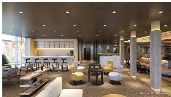
ouno cafe area