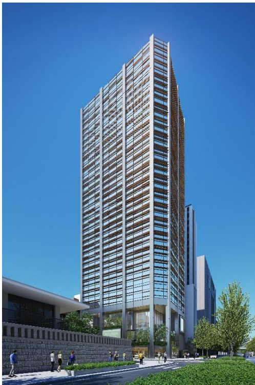
Exterior view of the Midosuji Daibiru Building